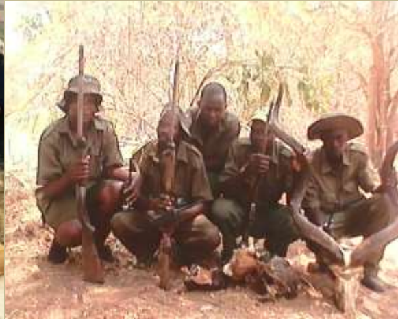
***lioness and kudu remains – neighboring concession***