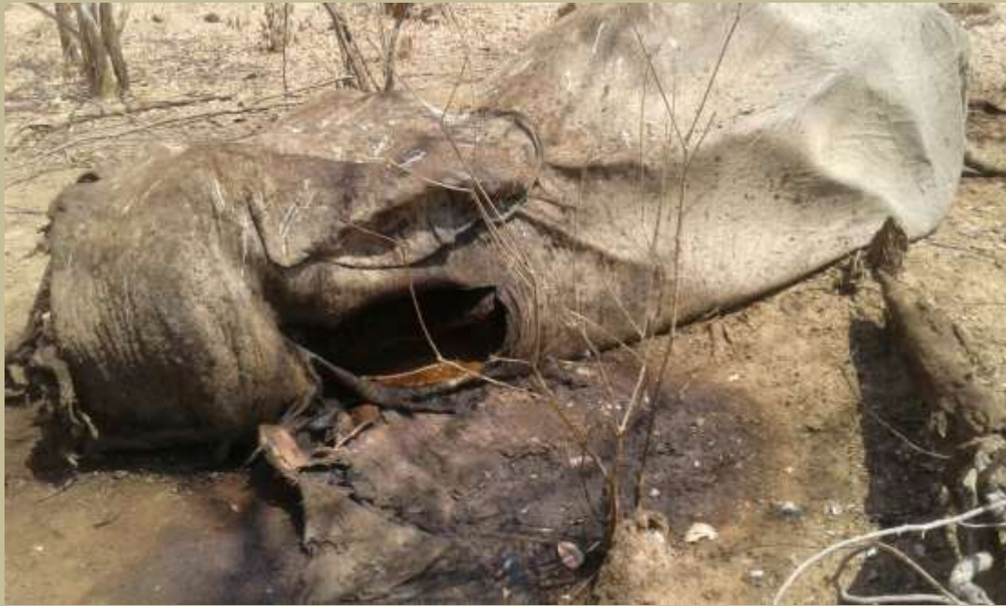
*** poached bull found by DAPU on neighbouring concession October 2017 – what a waste.***