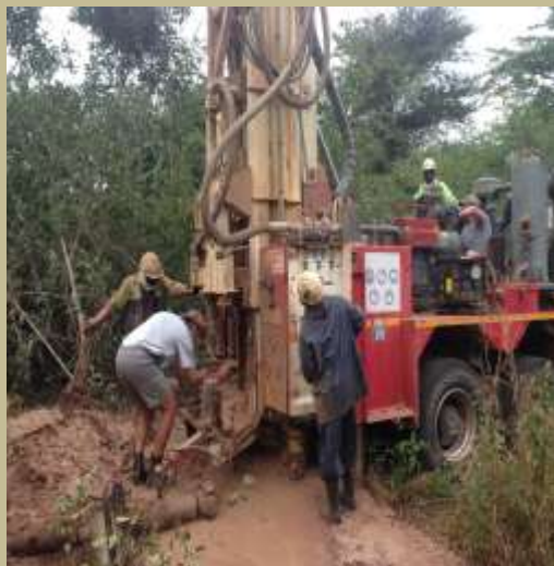
*** Sende Village 30,000 liters/ hr.***