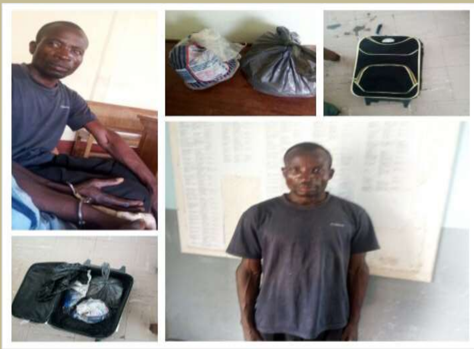
*** The accused with his Cyanide***

National Parks had a lucky break on Friday 25 th November at 2250 hours when they arrested a gentleman with “1.8kgs of cyanide at Dande River Bridge. The accused was en route to Angwa where the cyanide was to be bought by a poaching syndicate and to be used on elephants for their ivory”