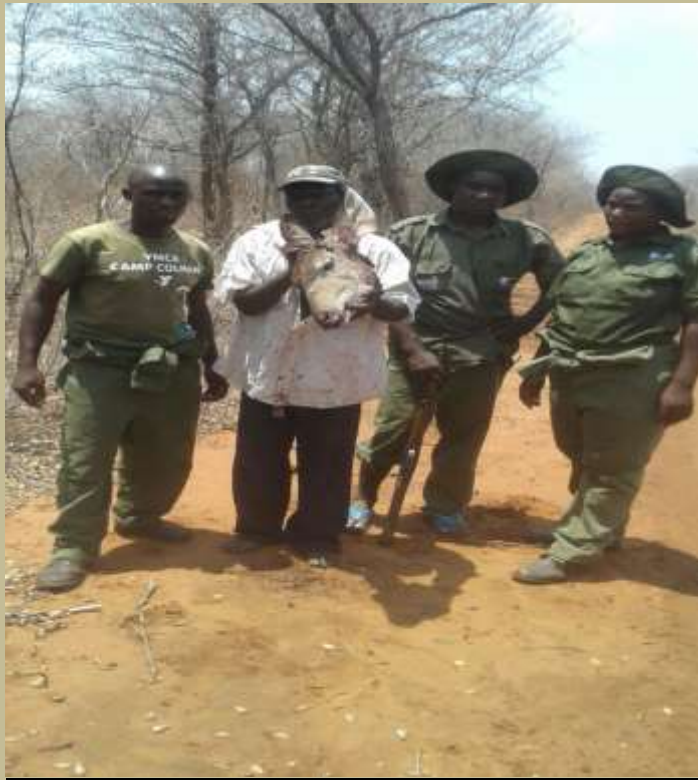
***Third time offender – kudu cow***