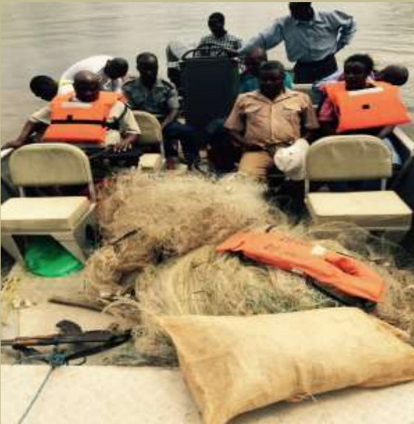
*** Haul of nets – Tunga river mouth, Chewore***