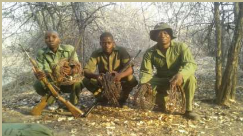
*** A typical haul of snares***