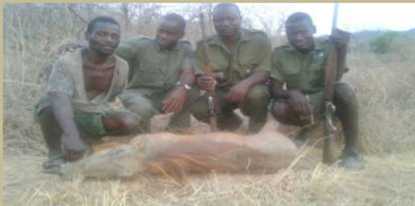
***DAPU call sign posing proudly with "their" poacher and "his" warthog! ***

*** It is clear to see the decline in poaching during the hunting season and also ... the impending increase in poaching activity as hunting slows down and we head towards Christmas. ***